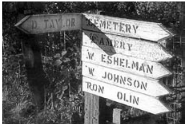
Locator signs, one of the many 4-H projects, can still be seen around the prairie.

One can think of many community functions over the years raising money for 4-H projects, fire department needs and kids doing community deeds. One 4-H project the kids performed was fashioning, and painting the sign at the cemetery, installing posts at some of the local ponds with ropes and intertubes tied to them for the safety of swimmers. The kids even got together working as a group raising funds charging or receiving donations of a various amounts, mowing grass, stacking wood or general cleanup of yards for some of the elderly and others.